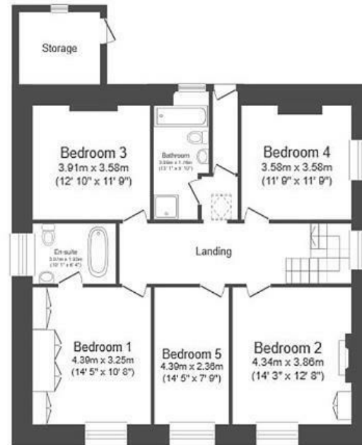
First Floor Floor area 109.1 sq.m. (1,174 sq.ft.)