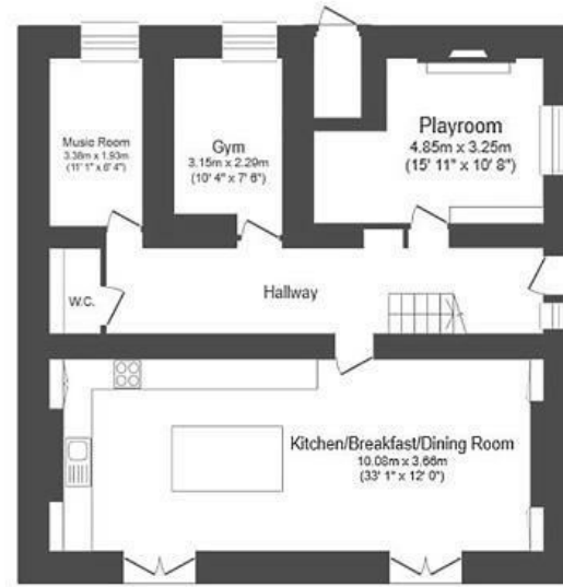
Lower Ground Floor Floor area 101.1 sq.m. (1,088 sq.ft.)